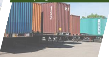
Drayage & Shunting