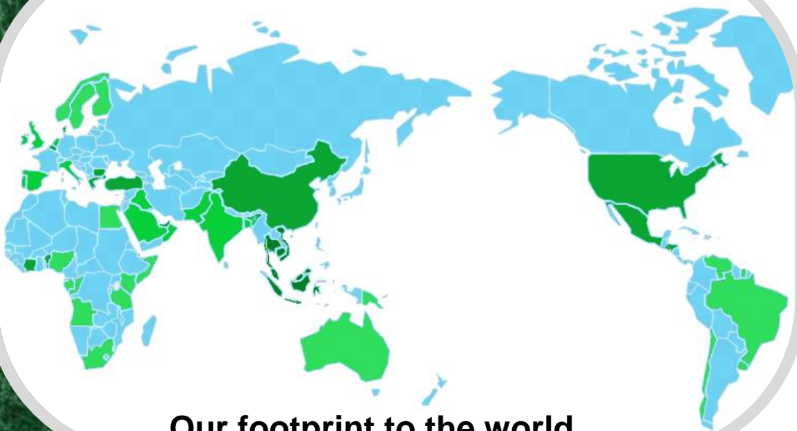
Our footprint to the world

We coordinated the movement of more than 230k TEUs around the world