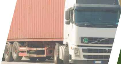
Long & Short Haulage

Collaboration with more than 100 haulage and transporter service providers who we had vet through their capacity, performance, and quality.